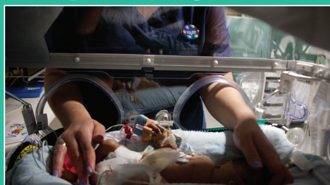
Pictured: The Panda Warmers Bed in use